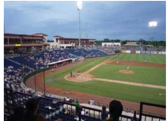
View from the suite at the 2009 Region IV Membership Meeting and Appreciation Night

Thank you for the opportunity you provided me to serve.